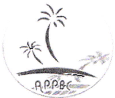
Autism Project of Palm Beach County